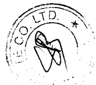
THE PHOSPHATE COMPANY LTD. Table II - Statement Showing shareholding pattern of the Promoter and Promoter Group as on 31/12/2019